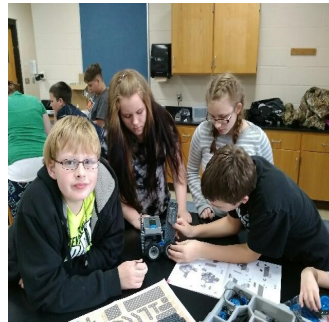
The 4-H After-School Robotics Club in Iosco County received a $1,000 Michigan 4-H Legacy Grant to use VEX Robotics as a tool

Learn more or apply online at http://mi4hfdtn.org/grants . Questions? Contact the Michigan 4-H Foundation at 517-353-6692.